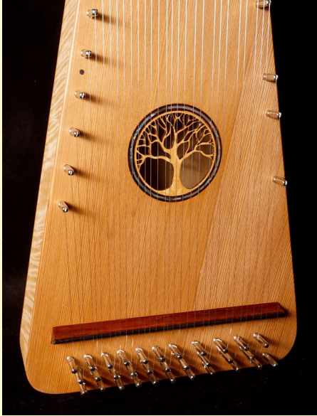
Above - a custom bowed psaltery Below - a hammered dulcimer