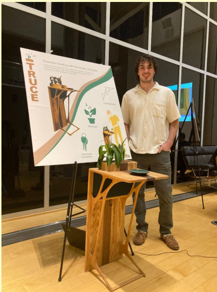
Above: a table that plays "biomusic" from the plant Below: the "Rocktagon" multi-surface drum

for ten different acoustic instruments. They include hammered dulcimers, folk harps, bowed psalteries, zithers, octave mandolins, tongue drums, Appalachian dulcimers, guitars, monochords and thumb pianos. His three top-selling instruments include hammered dulcimers, for which he has designed eleven different models, two models of octave zithers, and also bowed psalteries.